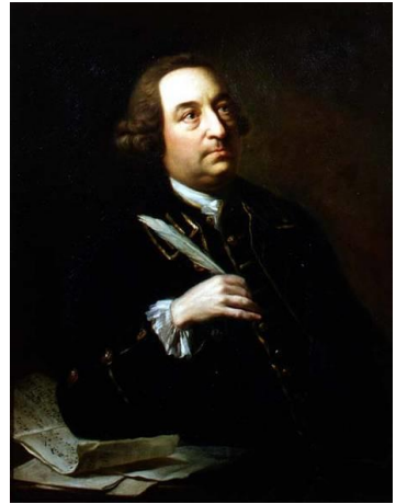
John Christopher Smith by Johann Zoffany (1763)