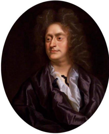
Henry Purcell by John Closterman (1695)