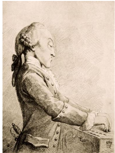
Thomas Augustine Arne by Francesco Bartolozzi (c.1770)