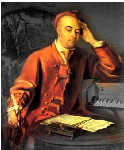
George Frideric Handel by Philip Mercier (1713)