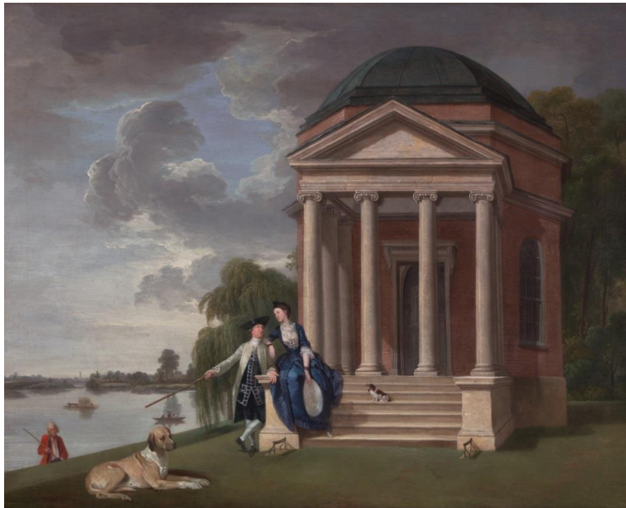
(David Garrick and his wife by his Temple to Shakespeare, Hampton, by Johan Zoffany c.1762)

A Concert of 18 th Century Keyboard Music by composers associated with David Garrick, including Handel, Arne, Stanley, J.C. Smith and J.C. Bach