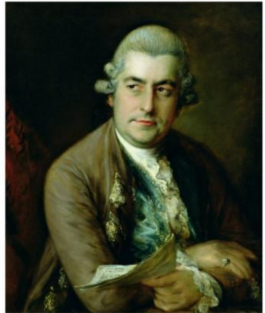
Johann Christian Bach by Thomas Gainsborough (1776)