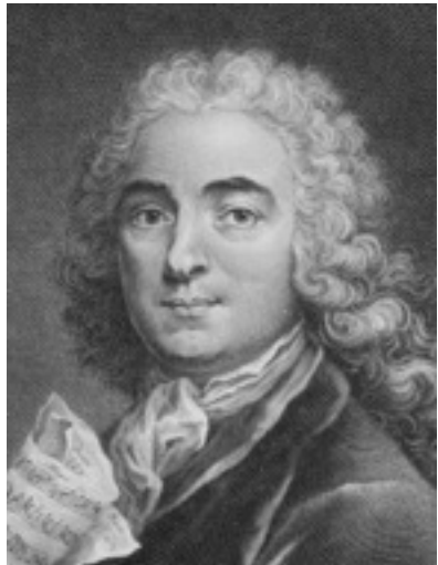
Jean- Jean-Marie Leclair (1697 – 1764)